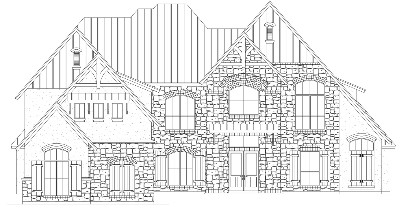
Front Elevation #4419